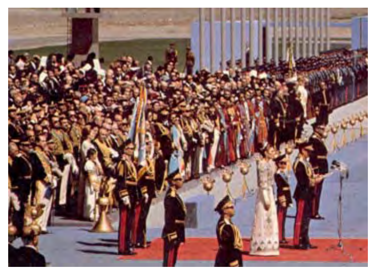
His Imperial Majesty made the first speech of the celebrations:

"O Cyrus, great King, King of Kings, Emperor of the Achaemenians, monarch of the land of Iran. I, the Shahanshah of Iran, offer thee salutations from myself and from our nation.