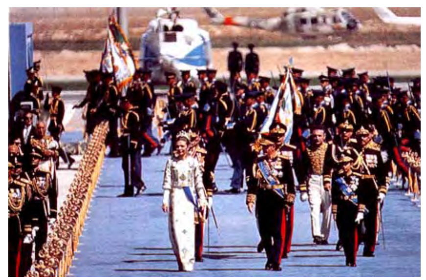
The Imperial Family of Iran arriving at Pasargad for the opening ceremony.